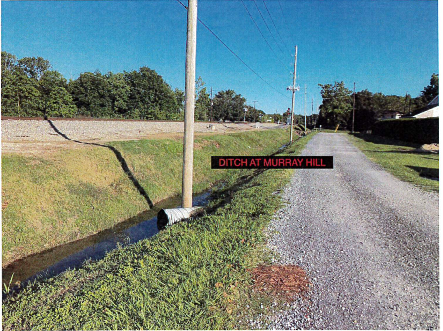
DITCH AT MURRAY HILL