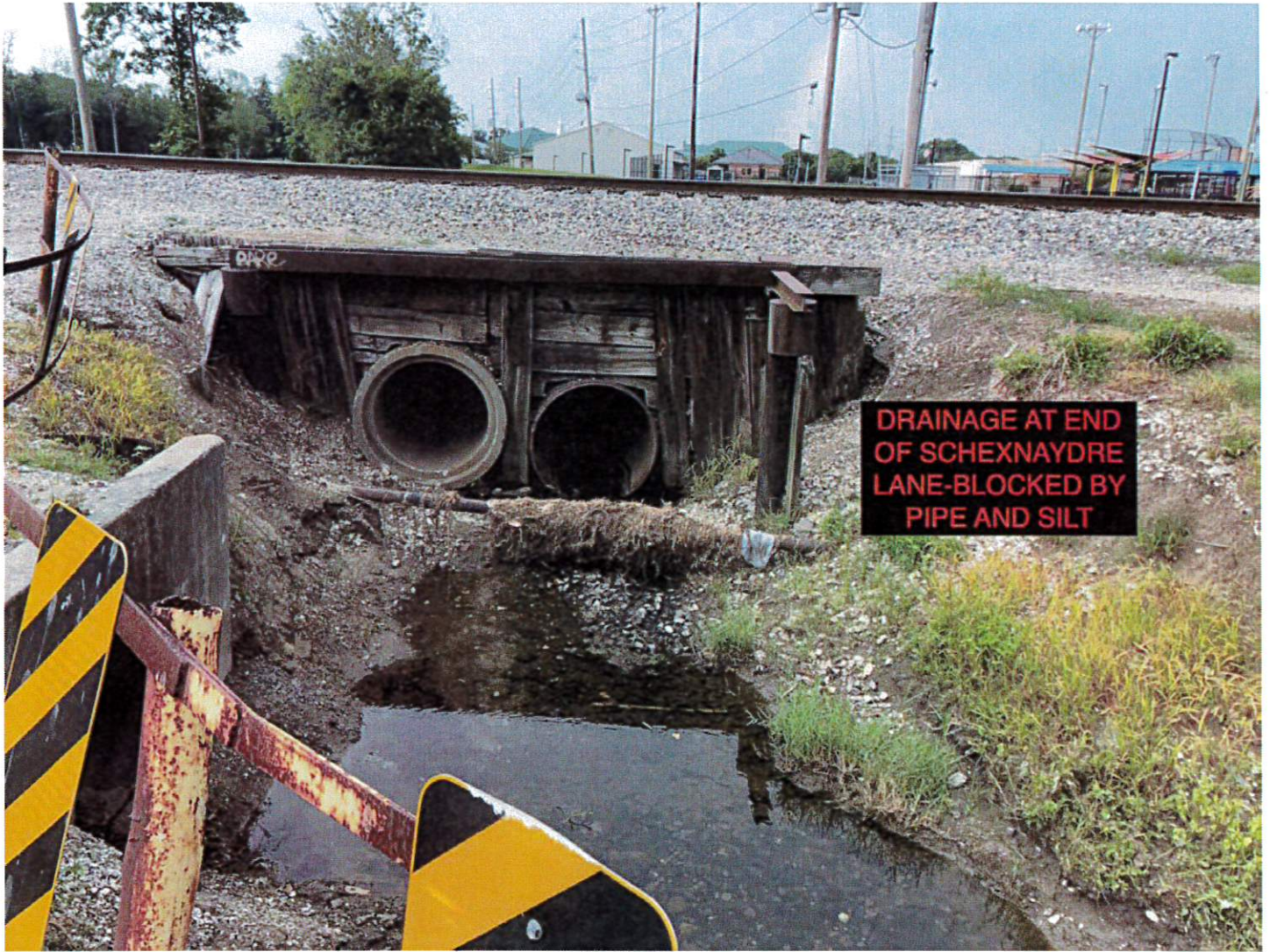
DRAINAGE AT END OF SCHEXNAYDRE LANE-BLOCKED BY PIPE AND SILT