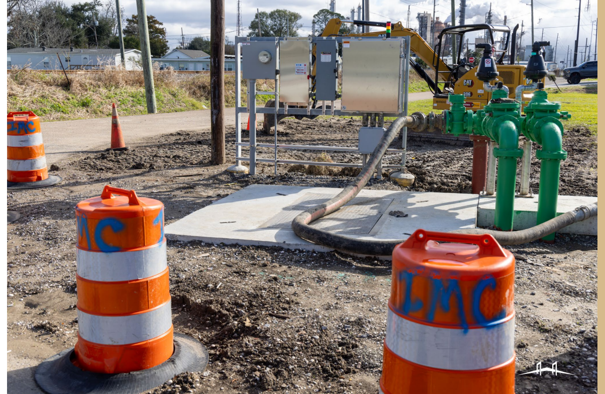
Clayton Drive, Norco