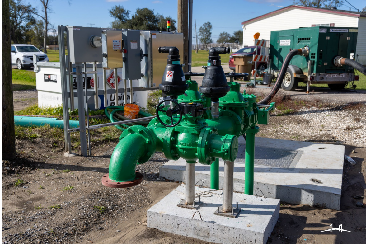
East Street, Norco