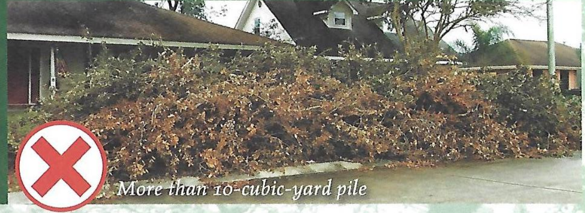
More than 10-cubic-yard pile