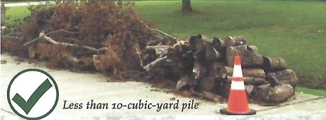
Less than 10-cubic-yard pile

tree limbs down to at least 6 feet in length. Individual pieces should not exceed 400 pounds. Residents should call Public Works at (985) 331-8604 to ensure pickup. Residents who need piles larger than 10 cubic yards picked up may call Progressive at 1-877-747-4374, use a third party or pick up the debris themselves. (Ord. 2013-0356)