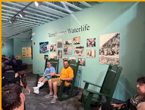
Terrebonne Wildlife Museum