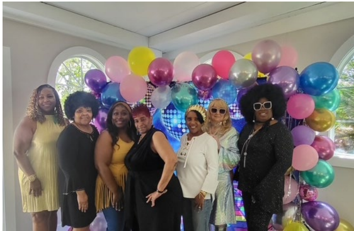
Staff Members at the St. Charles Women's Club Tea Cup Auction