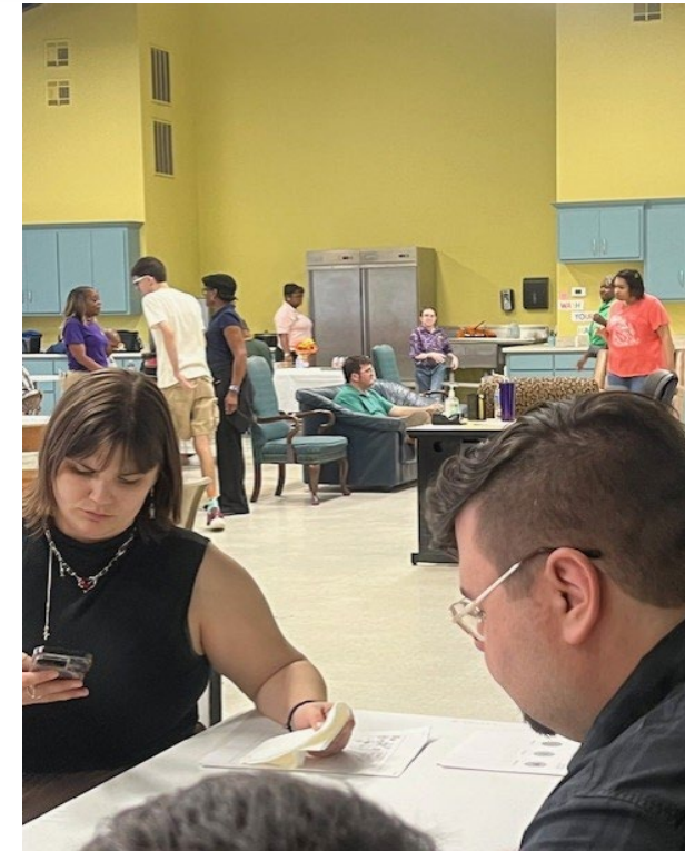
People First Wellness and Arc of Baton Rouge