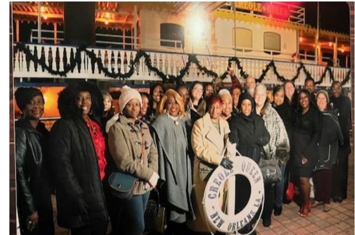
Leadership Training Dinner