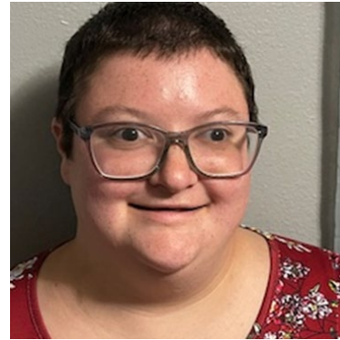
People First Secretary