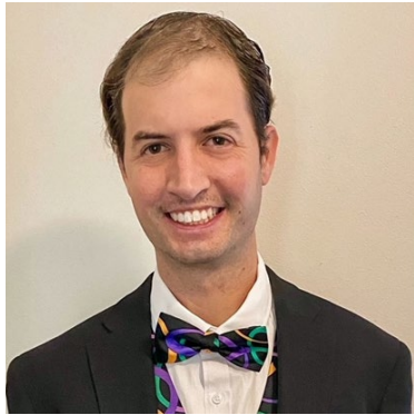
People First Advisor Former President