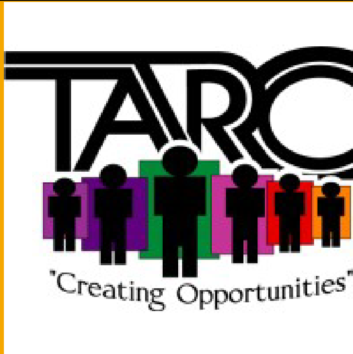
Terrebonne Arc Houma, LA