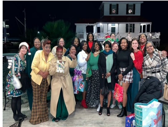
Team's Christmas Dinner