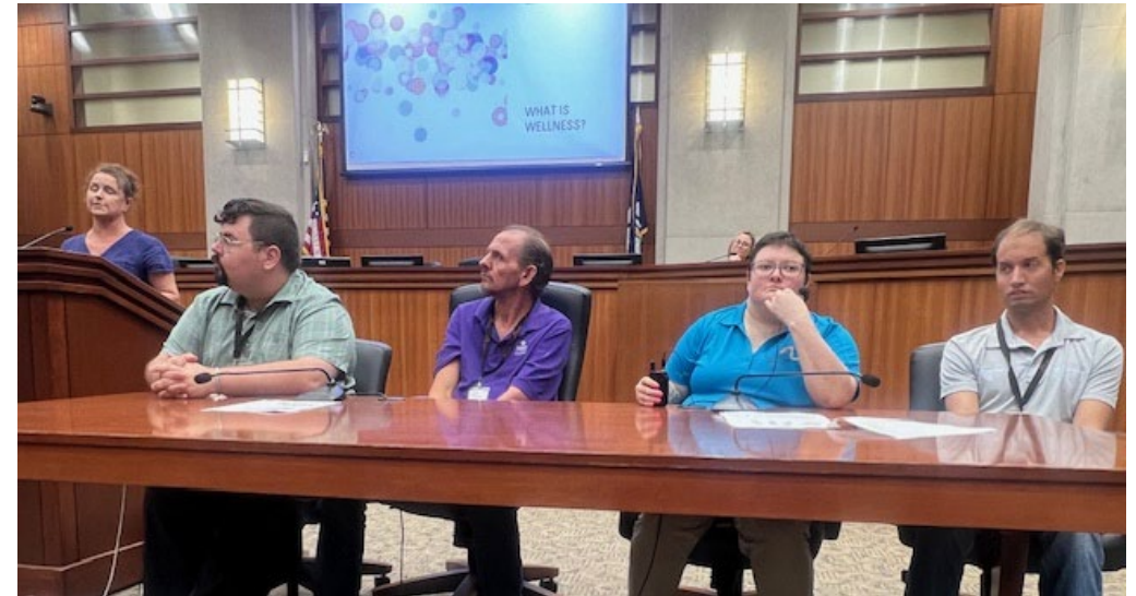
OCDD Clinical Director People First Wellness Group