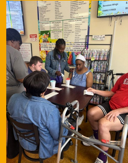
Brook's Snow World