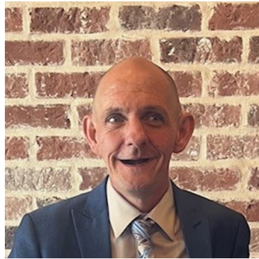
People First Treasurer & Sgt. Of Arms