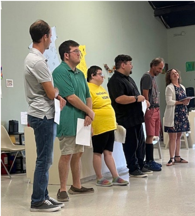
OCDD Clinical Director People First Wellness Group