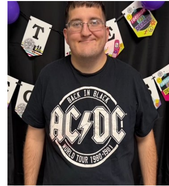
People First Advisor Former Vice President