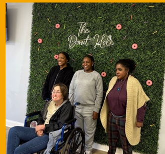
The Donut Hole