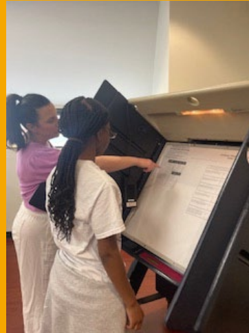
Voter Simulation Training