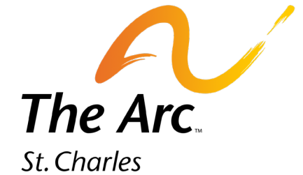
The Arc of St. Charles Day Habilitation Participation