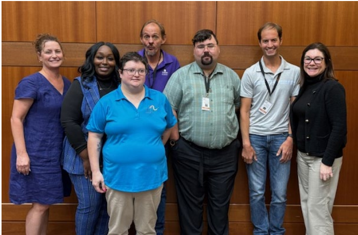
OCDD Clinical Director People First Wellness Group Arc of LA Program Director