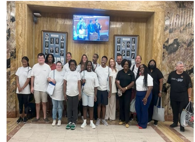
People First St. Charles