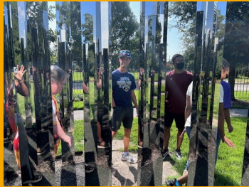
NOMA Sculpture Garden