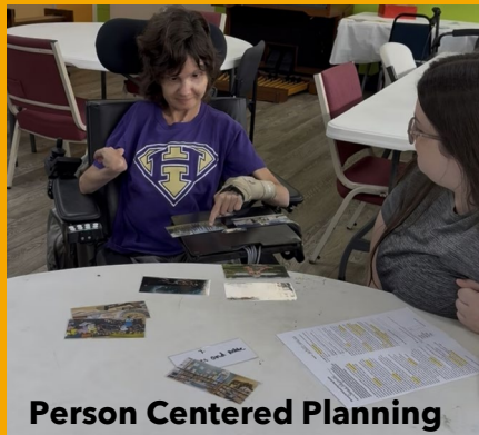
Person Centered Planning