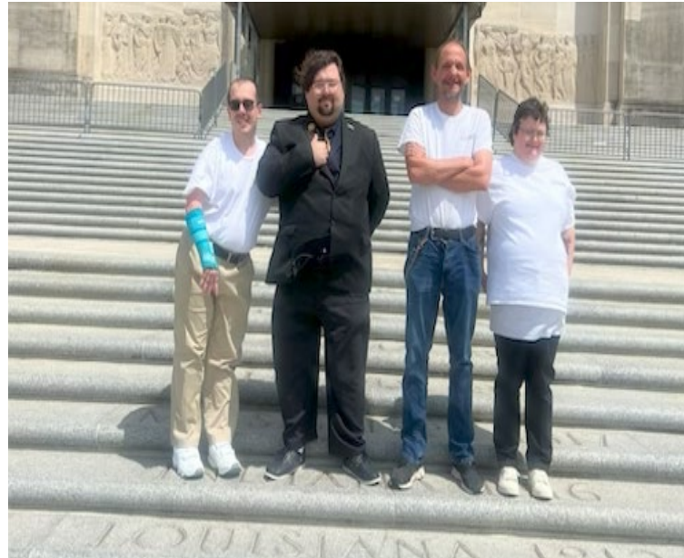
People First St. Charles Officers