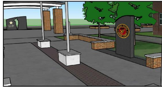
MEMORIAL PLAZA WALK - MONUMENT PERSPECTIVE NOT TO SCALE