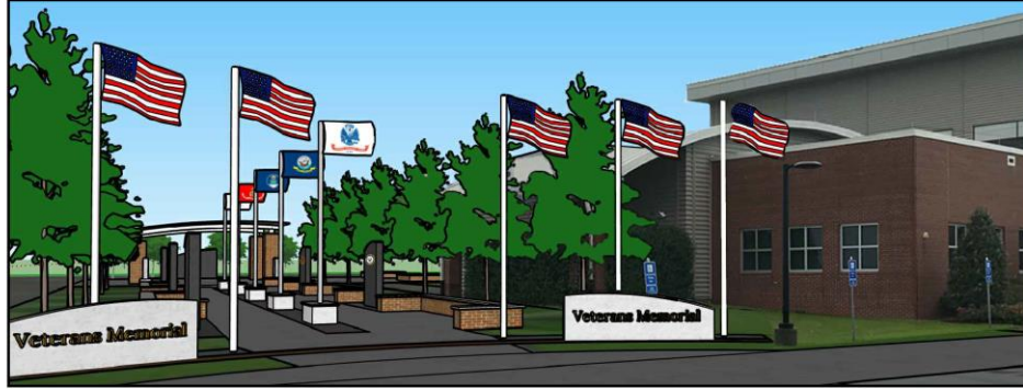
MEMORIAL PLAZA WALK - ENTRY PERSPECTIVE NOT TO SCALE