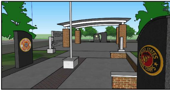
MEMORIAL PLAZA WALK - PAVILION PERSPECTIVE NOT TO SCALE