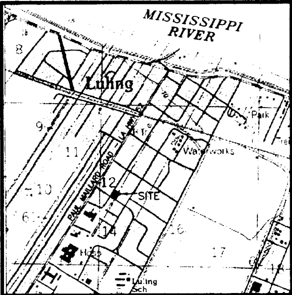
VICINITY MAP SCALE: 1" = 2000'