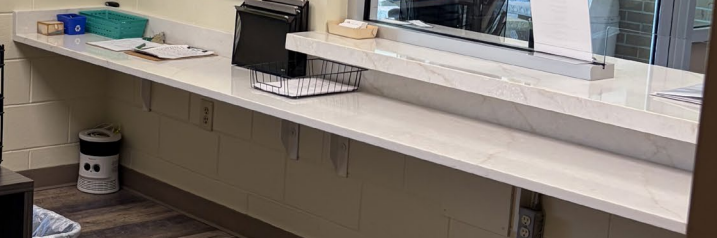
Arterbury ADS Counter