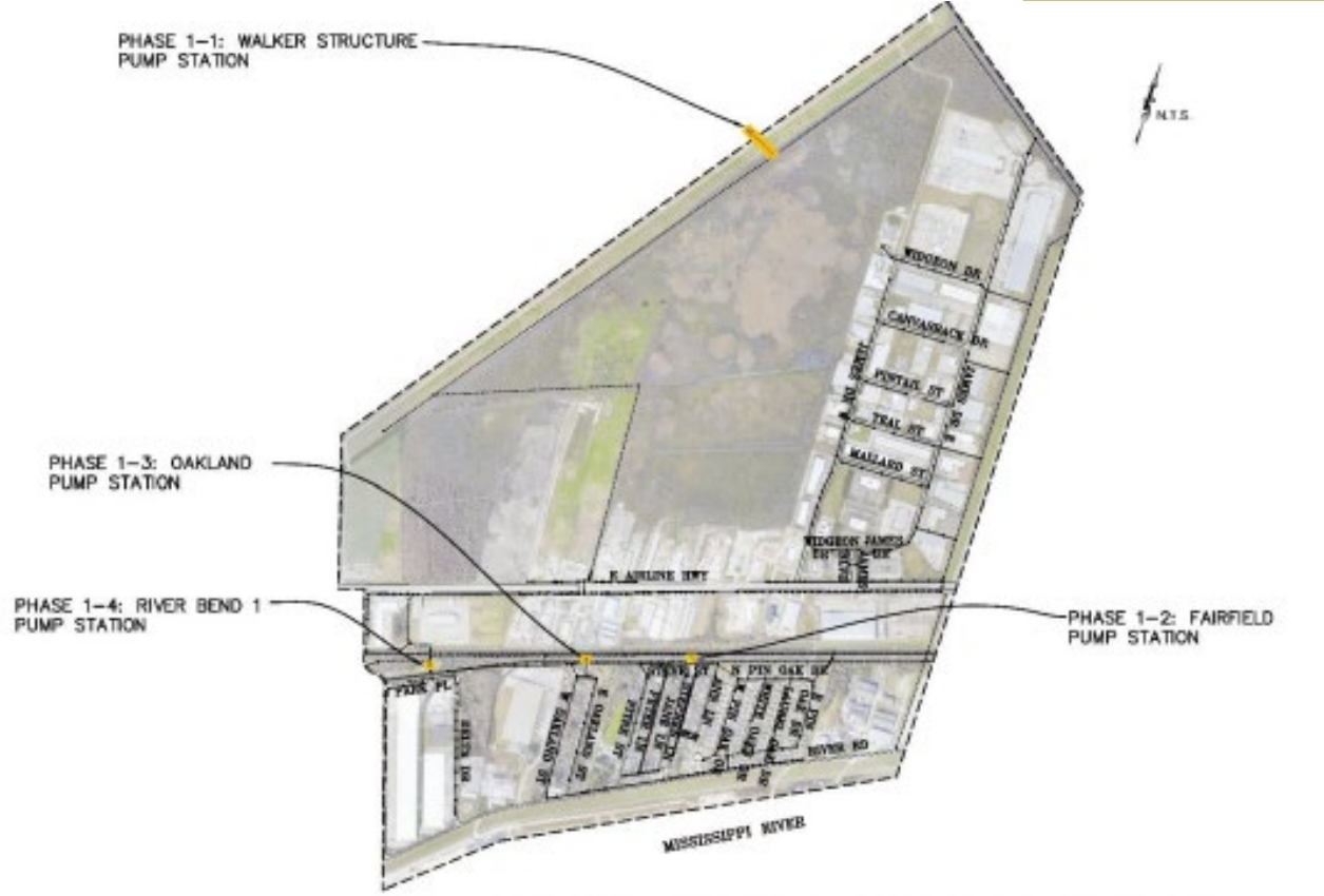
ALMEDIA PROGRAM - PHASE 1 IMPROVEMENTS 25-YEAR CRITERIA WITH SELECTED 100-YEAR IMPROVEMENTS