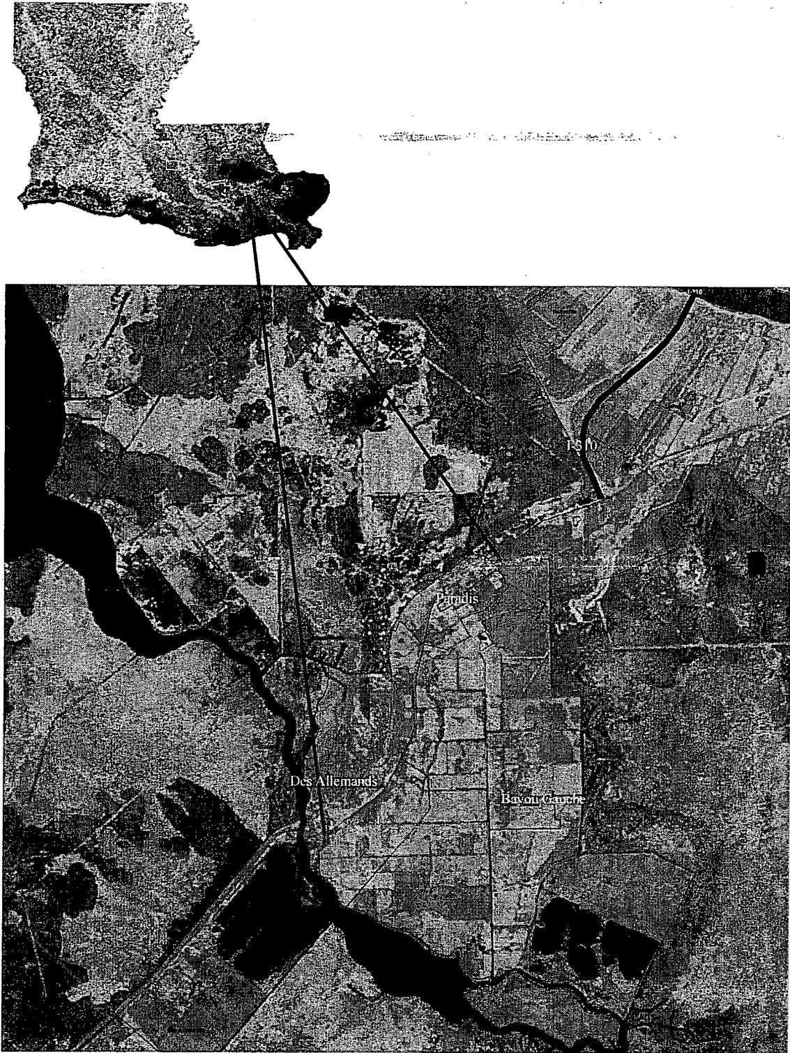
EXHIBIT C - LOCATION PLAT OF THE PARADIS MITIGATION BANK