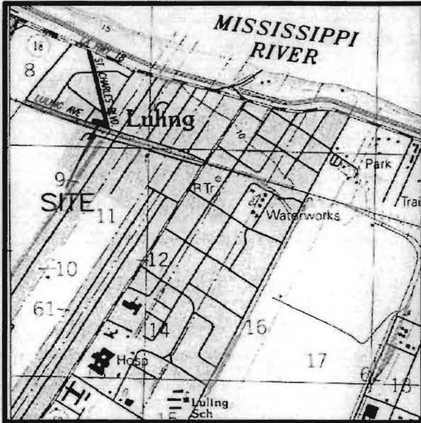
VICINITY MAP SCALE: 1" = 2000'