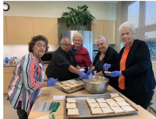
Making Sandwiches for Hahnville High