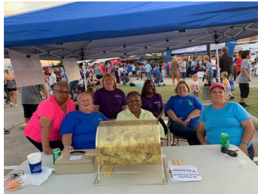
Battle of the Paddle