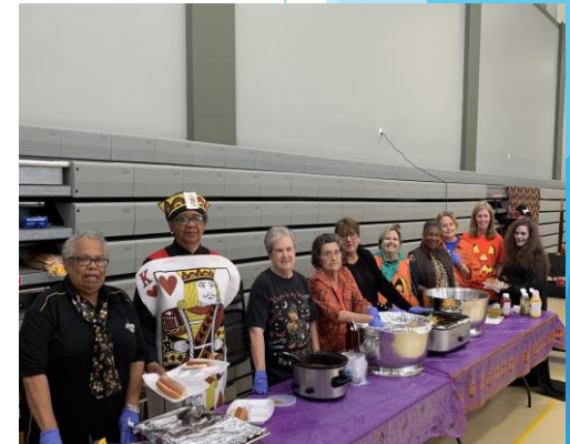
COA, RSVP & Parks and Recreation's Fall Fest