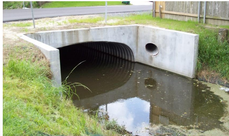
$1.6M – Primrose Canal Crossing Culvert Improvements