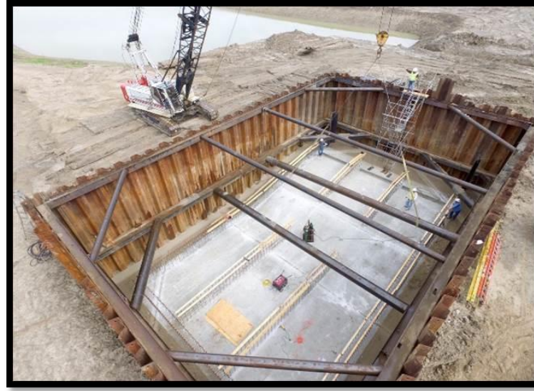
$1.4M – Willowridge Pump Station