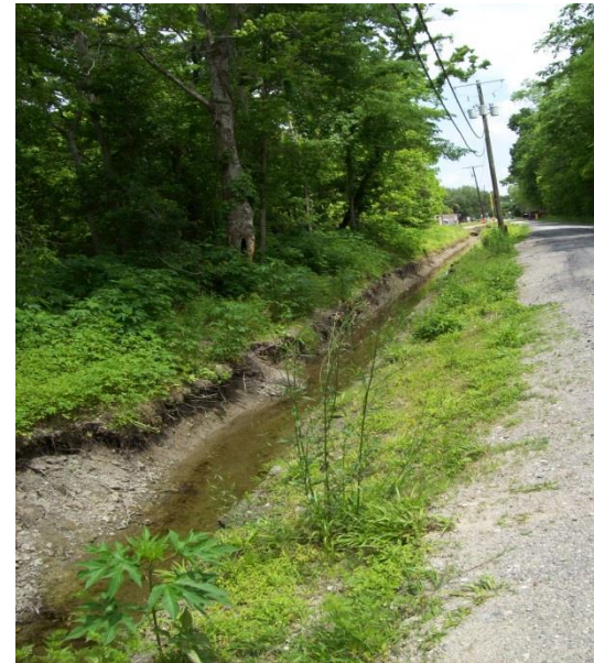
$551K – Mimosa Park Drainage Improvements