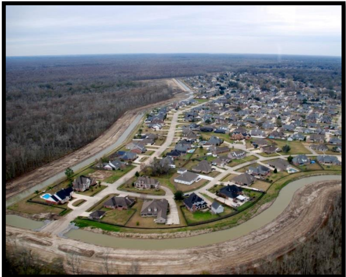
$3.9M – Willowridge Levee Ph. I