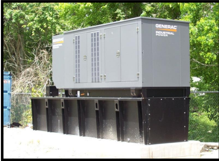
$209K – 4 Pump Station Generators