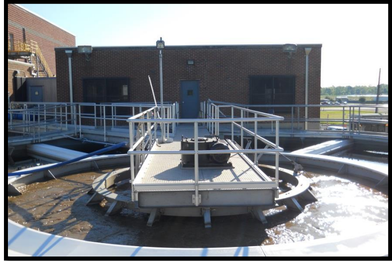
$152K– West Bank B-Plant Clarifier