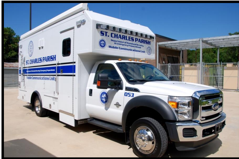
$262K – Mobile Communications Unit