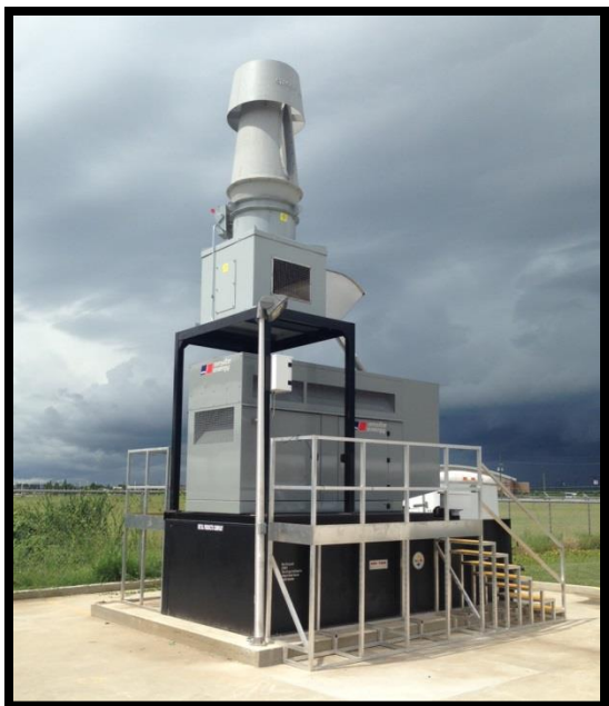
$329K – Animal Shelter Generator