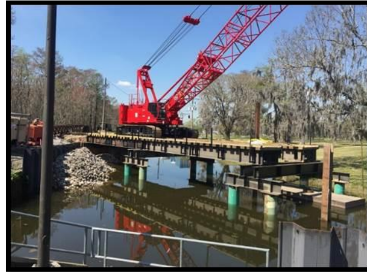
$3.9M – Willowridge Levee Phase III