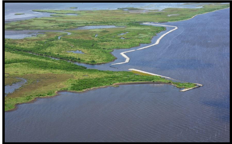
$3.7M – East LaBranche Shoreline Protection Project