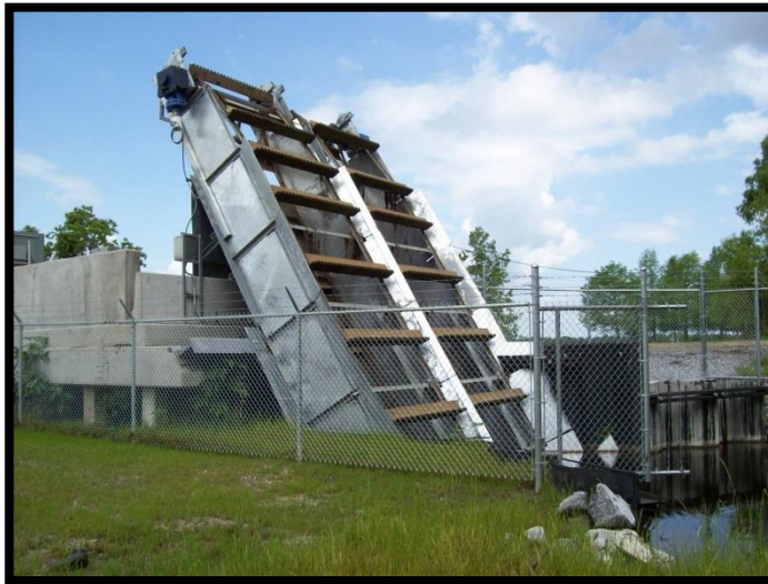
$816K – Up the Bayou Pump Station Bar Screen Cleaners