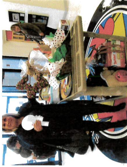
TOP: Non perishable foods are collected at each meeting, for local food pantries, as well as personal care items for the Battered Women's Shelter