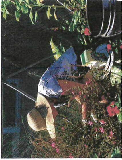
TOP: The Garden Divas maintain the "Butterfly Dome" at Luling Elementary and also provide learning opportunities for the students BOTTOM: Volunteers provided the annual "Christmas Penny Party" for the residents of Luling Living Center as well as a Valentine's Party for clients of the ARC of St. Charles