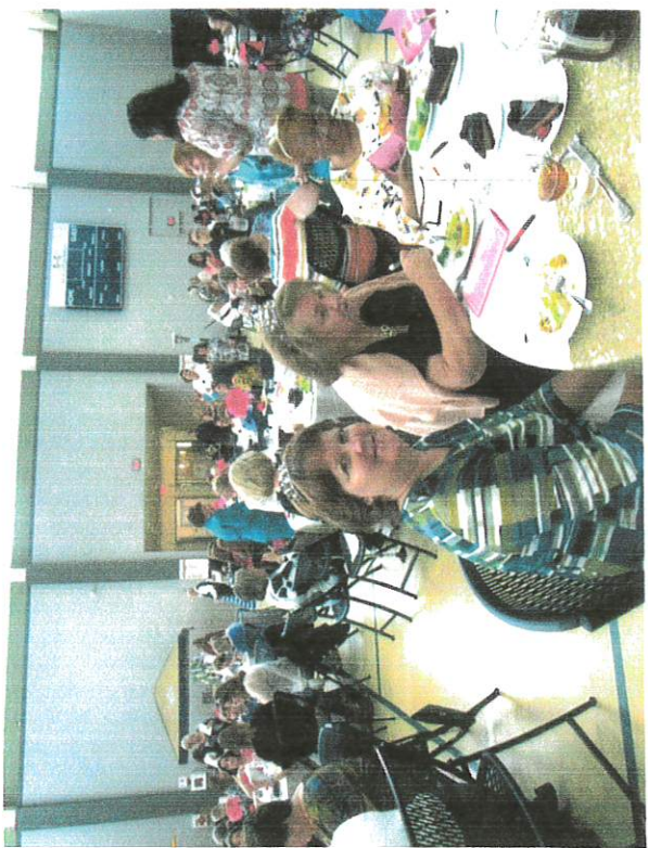
370 Ladies attended the Annual Teacup Auction at the Edward Dufresne Center