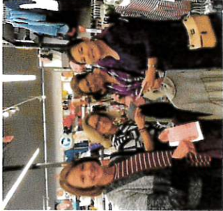
Christmas shopping and delivering the gifts for children in SCP Headstart The Music Group entertained the residents of Luling Living Center, Ashton Manor, SE LA War Veterans Home, Ormond Nursing and Care Center & The ARC of St. Charles