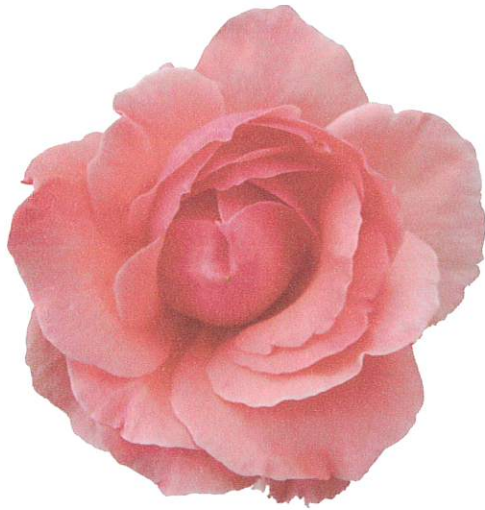
St. Charles Women's Club Making A Difference While Having Fun