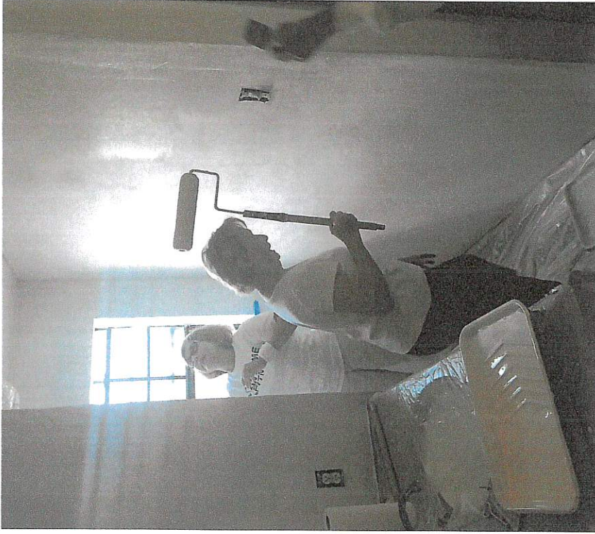
Labor of Love volunteers repairing homes of disadvantaged citizens in St. Charles Parish. St. Charles Women's Club provides labor and funding for projects done through a partnership with St. Charles Borromeo Peace & Justice Ministry and St. Charles Parish Department of Community Services