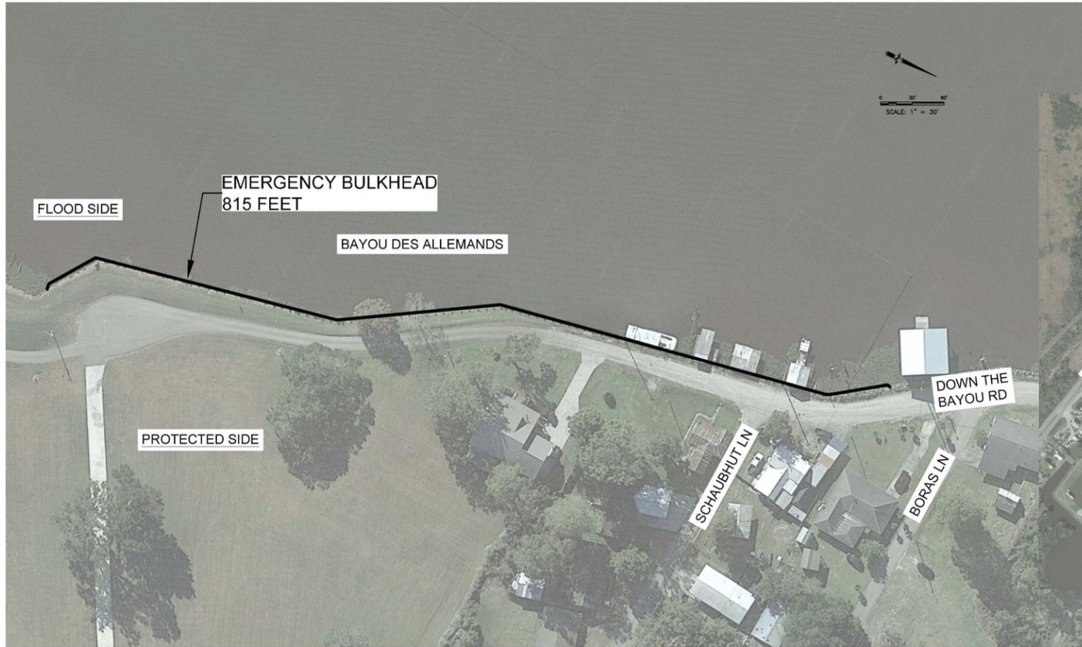
EMERGENCY BULKHEAD PLAN SCALE: 1" = 30'