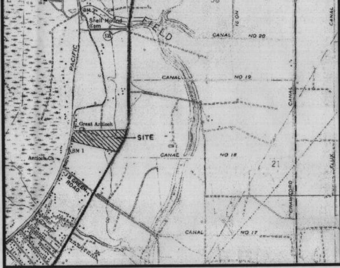
VICINITY MAP SCALE: 1" = 2000'