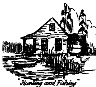
Hunting and Fishing