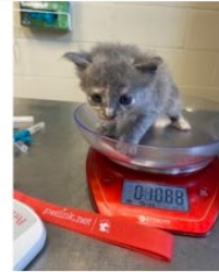
June Domestic Shorthair/Domestic ... Female, Young Luling, LA