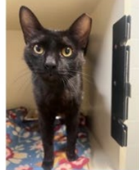
Bruce Lee Domestic Shorthair/Domestic ... Male, Adult Luling, LA