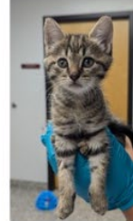
Jeb Domestic Shorthair/Domestic ... Male, Young Luling, LA