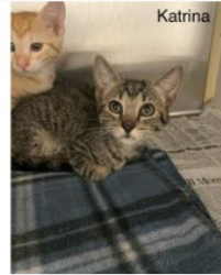
Katrina Domestic Shorthair/Domestic ... Female, Adult Luling, LA