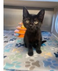
Nala Domestic Shorthair/Domestic ... Female, Young Luling, LA