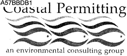
EXHIBIT "A" 2024/2025 Rate Schedule